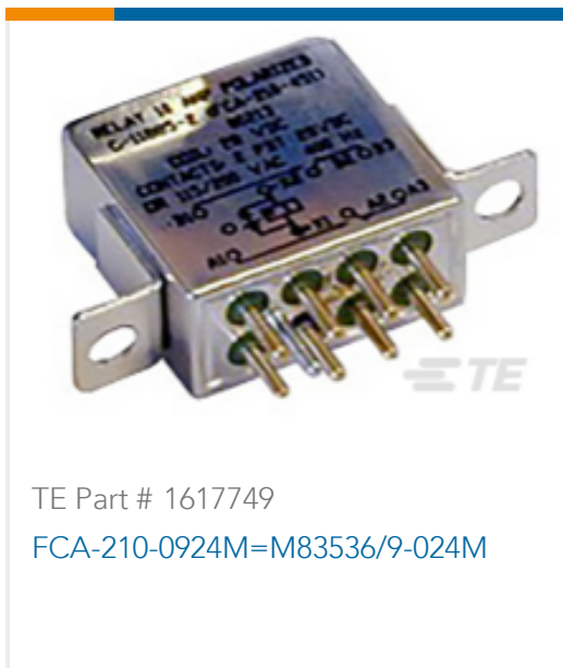
TE Part # 1617749 FCA-210-0924M=M83536/9-024M